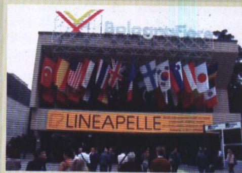
A view of the Entrance of Lineapelle Fair-2012

The "National Pavilion" was organized by PTA in Lineapelle Fair held from 19-21st October, 2012 at Hall # 22 & 20 in Bologna, Italy for participation of our 21 final selected member participants with the financial assistance of Trade Development Authority of Pakistan Karachi for the supreme objective of promoting country's exports via this vital world famous event of Leather Industry.