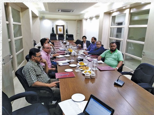
Participants Attending Awareness Session