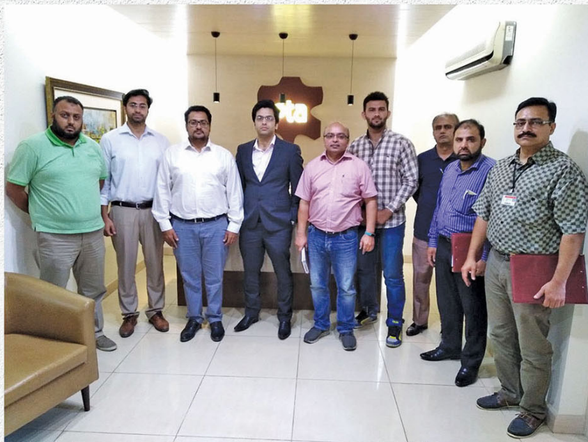
Group photograph of all participants along with trainer from SGS Pakistan