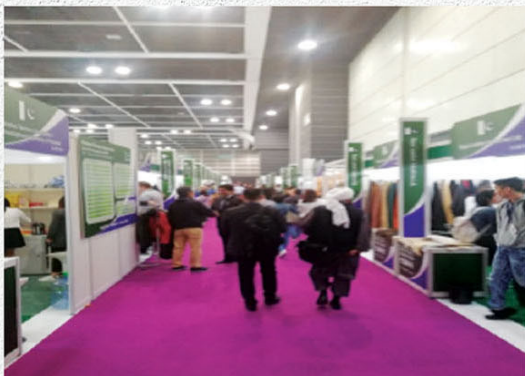
Entrance of Pakistan Pavilion in APLF-2018 at Hong Kong

Outcome of Pakistan's participation in this event is very encouraging and the business concluded during the Fair was approximate US$ 20 Million and a number of queries were also received of US$ 5 Million (Approx). All the member participants of Pakistan Pavilion in APLF-2018 assured their participation in the next event of APLF-2019 in Hong Kong too.