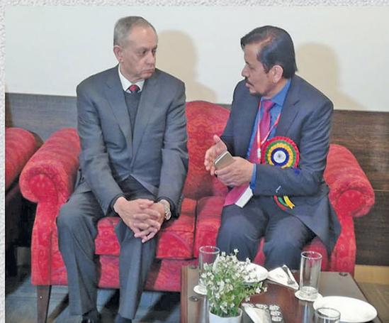
PTA Members Meeting with Mr. Abdul Razak Dawood, Advisor on Commerce held on 28.01.2019 at Lahore Int'l Expo Centre to discuss issues of Leather Industry