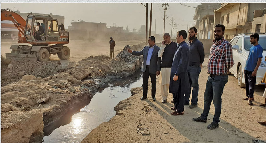
INFRASTRUCTURE COMMITTEE MEMBERS INSPECTING WORK OF CONSTRUCTION OF ROAD ON SOUTHERN AVENUE.