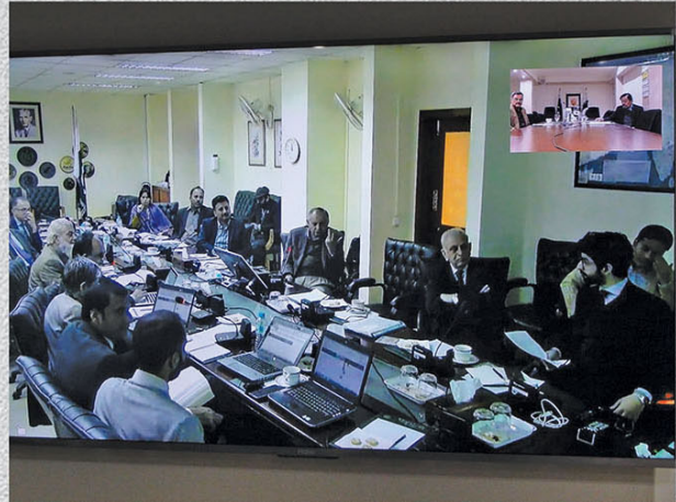
View of the meeting held via Video Conference simultaneously in Ministry of Commerce, Islamabad and PTA Northern Zone Office, Lahore on 12.01.2019, representative of Pakistan Chemicals Manufacturers Association are also seen

However, the Chairman, PTA strongly explained PTA's genuine demand for reduction in duty on some tanning chemicals. The Advisor on Commerce & Textiles agreed with PTA's proposal and assured to resolve the issue of Leather Industry.