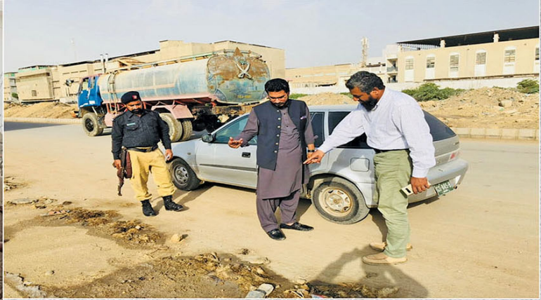
SECRETARY PTA (S.Z) BRIEFING ASSISTANT COMMISSIONER KORANGI ABOUT THE ILLEGAL ENCROACHMENTS BEEN DONE ON ROAD 5000.