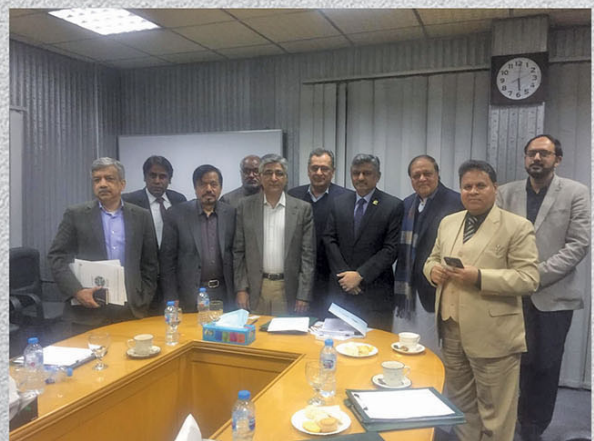
A group photo of PTA delegation snapped with the Secretary Commerce (4R)