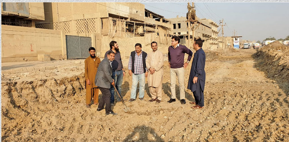
GROUND BREAKING CEREMONY OF CONSTRUCTION OF SOUTHERN AVENUE ROAD IN SECTOR 7-A.