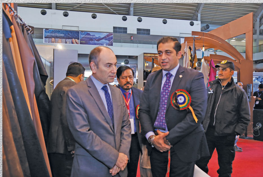
Honourable Consul General of Turkey in Pakistan, Mr. Emir Ozbay visiting stand of Royal Leather and Pelle Classics during PMLS-2019 at Lahore Int'l Expo Centre