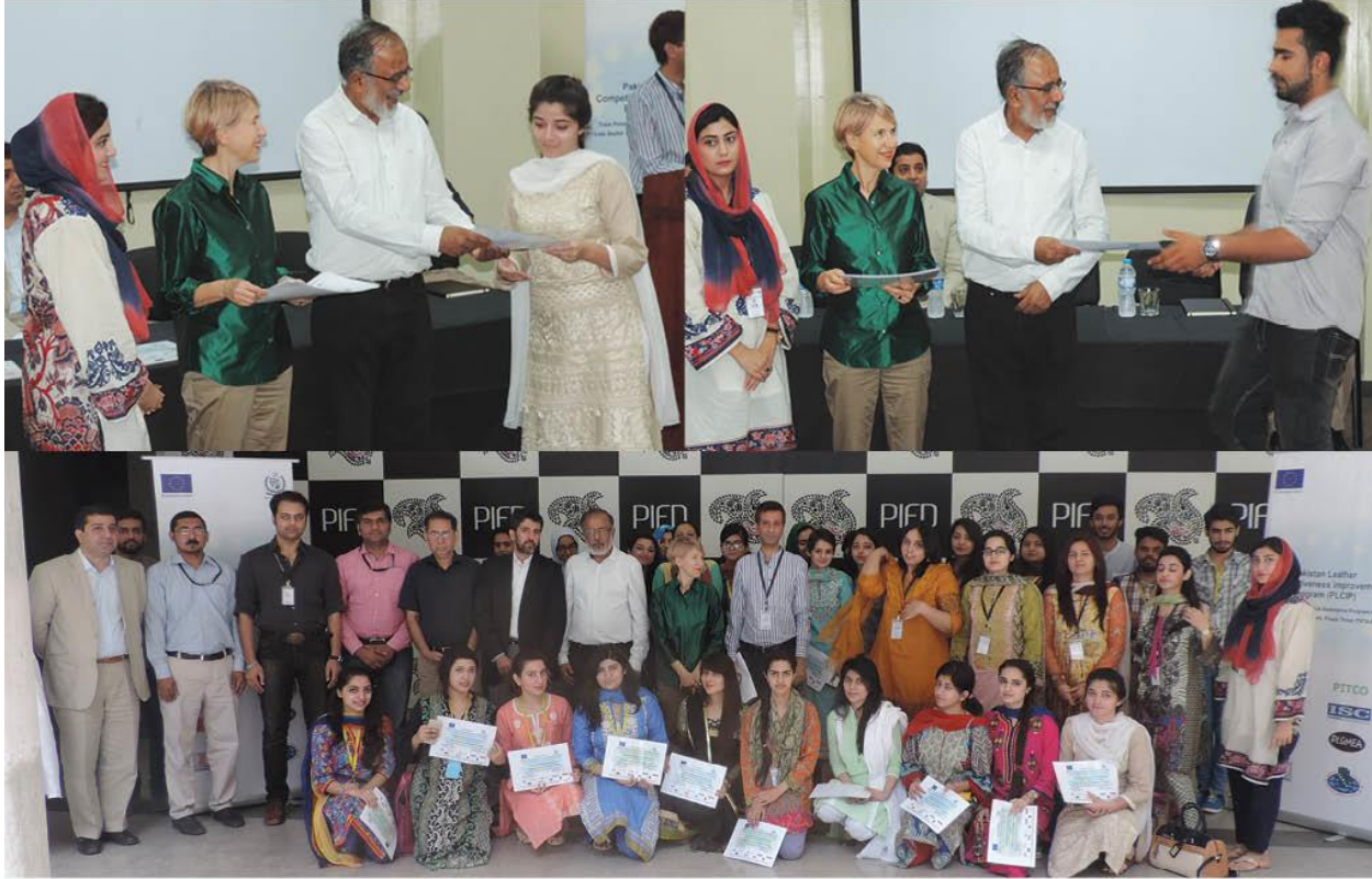
Certificate Awards Distribution ceremony held in PIFD, Lahore