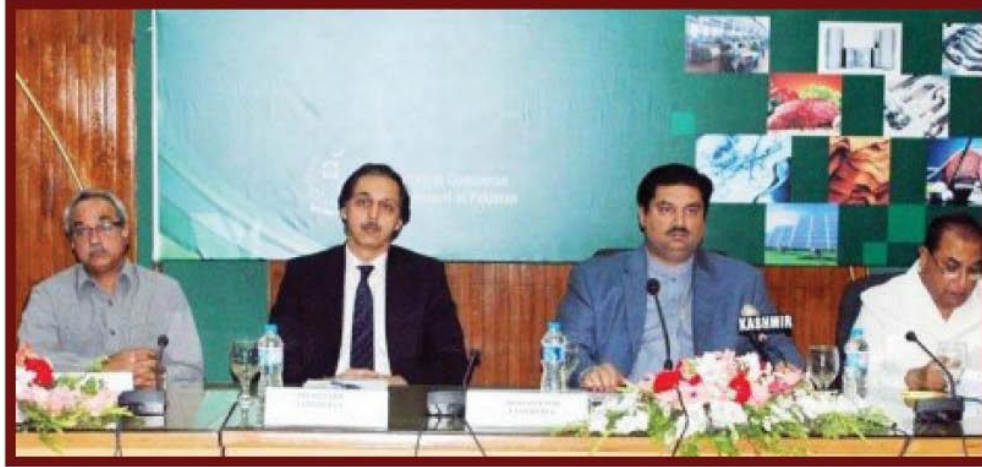
Minister for Commerce, Engr. Khurram Dastgir Khan chairing the meeting of 64th Advisory Council of Ministry of Commerce on May 4, 2015.

After presentation of the salient features of the Strategic Trade Policy Framework” (STPF) 2015-18 specifically mentioning the formulation of Leather Export Promotion Council of Pakistan by the Minister of Commerce, all participants were invited to give their feedback for STPF 2015-18.