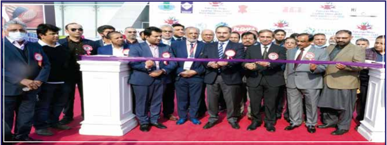
Honourable Chairmen of PTA, PFMA and PGMEA inaugurating the Show on 29.01.2022 at Lahore Expo Centre