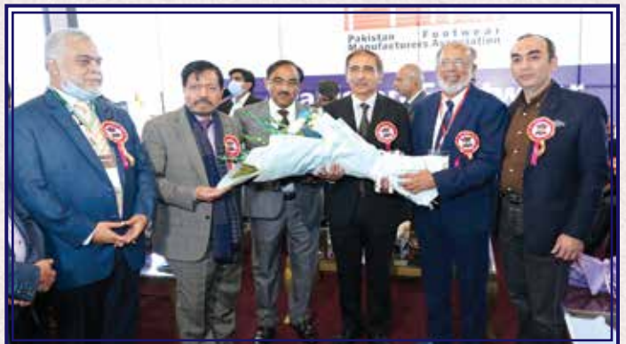
Bouquet presenting to Chairmen, PTA & PFMA and Co-Convener, PMLS during PMLS-2022